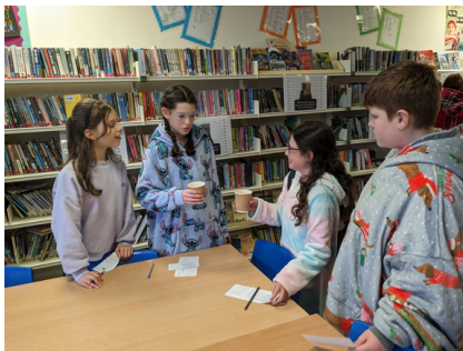
World Book Day 2024.

Our SWR Reading Ambassadors also continue to do a great job of supporting and encouraging active reading at school through our 'buddy reading' programme – we're very proud of them all!