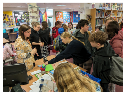
World Book Day 2024.