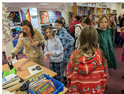
World Book Day 2024.