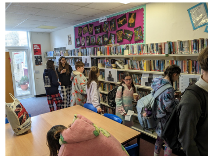
World Book Day 2024.