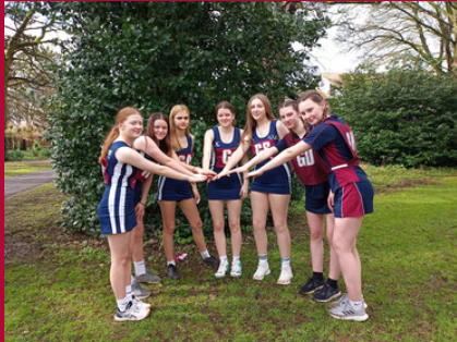
SWR Netball Team

With that said, we are incredibly proud of their commitment and resilience despite some heavy competition and weather conditions! Well done to all involved.