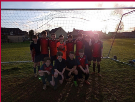
Year 7 Football Team